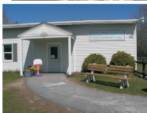
Youth Community Center