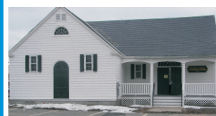
Dorothy Stevens Community Center

REGISTER ONLINE AT WWW.KENNEBUNKREC.COM ...CREATE YOUR ACCOUNT TODAY!!!!