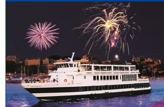
Dinner Cruise on beautiful Lake Champlain