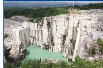
Rock of Ages Granite Quarry

$75 Due Upon Signing. *Price per person, based on double occupancy. Add $215 for single occupancy. Final Payment Due: 8/10/2023