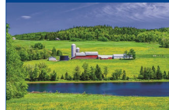
Beautiful Vermont Scenery