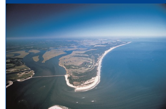
Aerial view of Amelia Island