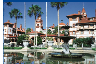
St. Augustine, our Nation's Oldest City

Day 9: After enjoying a Continental Breakfast, you will depart for home... a perfect time to chat with your friends about all the fun things you've done, the great sights you've seen and where your next group trip will take you!