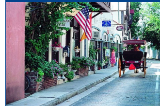
Historic St. George St