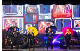
"Music and Memories" at the Greg Rowles Legacy Theatre