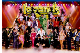
Exciting Legends in Concert